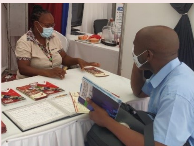
KUCCPS officer conversing with a delegate at the International Health Workforce Conference in Mombasa between February 7-9, 2022

The Kenya Colleges and Universities Placement Service (KUCCPS) was one of the participating institutions at the 2022 International Health Workforce Conference that aimed at harmonising curriculum and training of health professionals. By participating in various panel discussions, KUCCPS enlightened participants on the role that it plays in placing students in health-related courses and ensuring they enjoy government sponsorship while pursuing these courses.