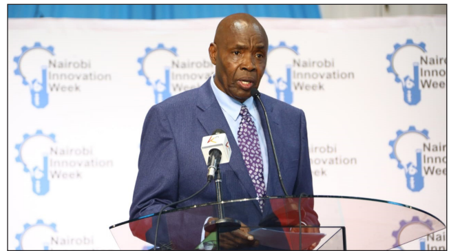
Hon. Ezekiel Machogu, Education Cabinet Secretary launches KUCCPS portal and 2023/2024 placement of students to universities and colleges during opening of the Nairobi Innovation Week at the University of Nairobi on May 17, 2023.

Machogu said that based on the 100 percent transition policy, the rest of the learners are eligible to compete for spaces in tertiary learning institutions.