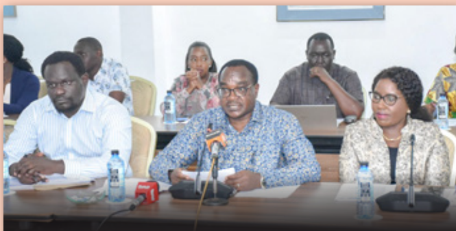
Cabinet Secretary for Education, Mr. Julius Ogamba, makes a presentation during the Senate Committee on Education retreat.

Due to its critical role in the education sector, KUCCPS' presence in the events provided crucial support to the Ministry and contributed insights to discussions on enhancing access to quality higher education and training in Kenya.